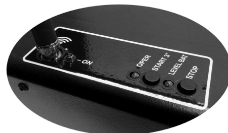
Console with controls and indications simple and intuitive