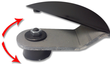
Retractable support and Anti-vibration adjustable foot