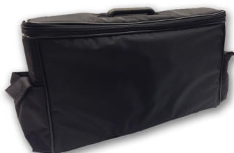
soft carrying case in black nylon